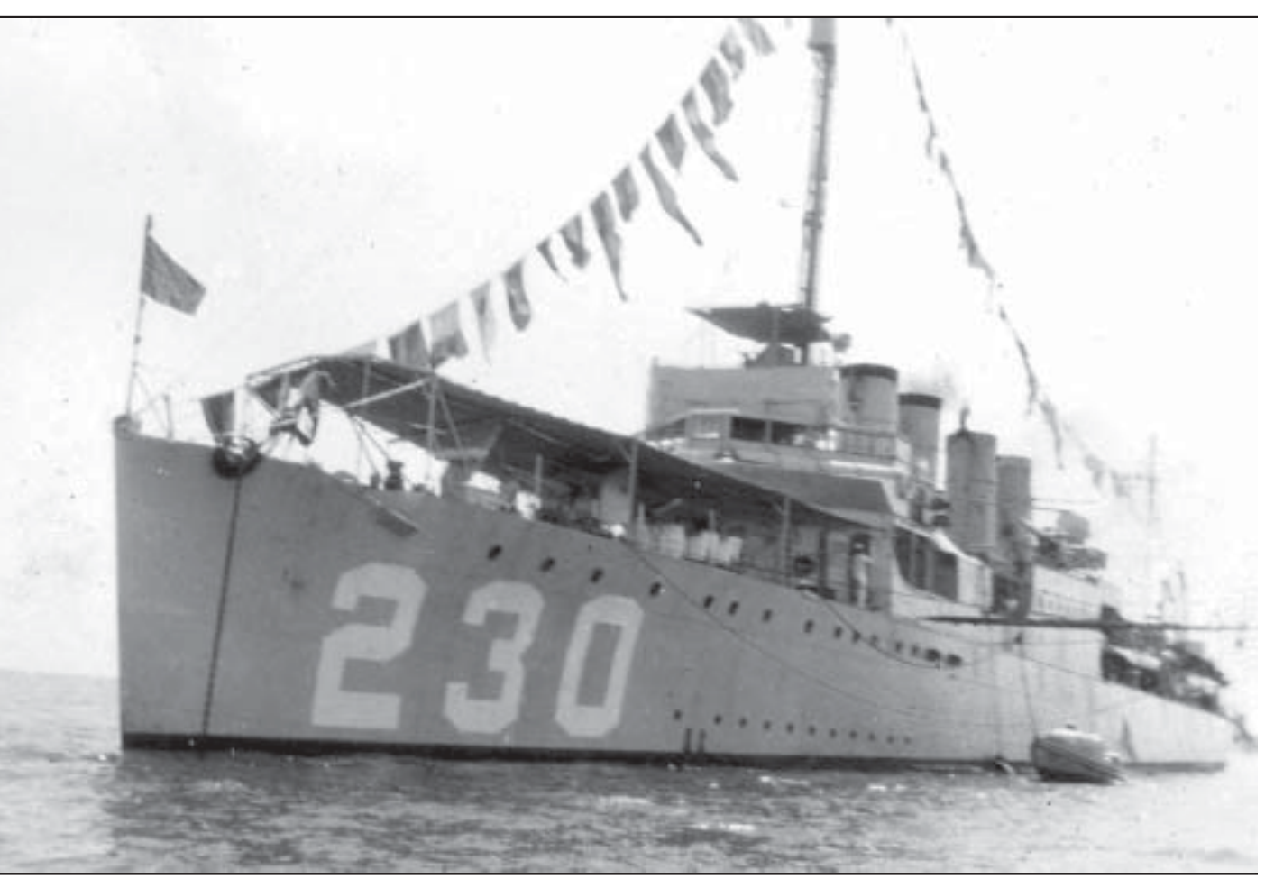
The USS PAUL JONES (DD-230) was a member of the large CLEMSON class of 156 destroyers, which began construction in 1919. Ordered for World War I, the ships were not delivered until the following year. As a result of the great size of the class and of the financial constraints on the navy during the Great Depression, another class of destroyers was not constructed until 1934.

By the early 1920s, the more than 1,700 miles of China's Yangtze River had become an extremely dangerous waterway for Americans and other foreigners. Large numbers of them lived in China as missionaries and in other capacities or were engaged in shipping and trade under the open-door policy.