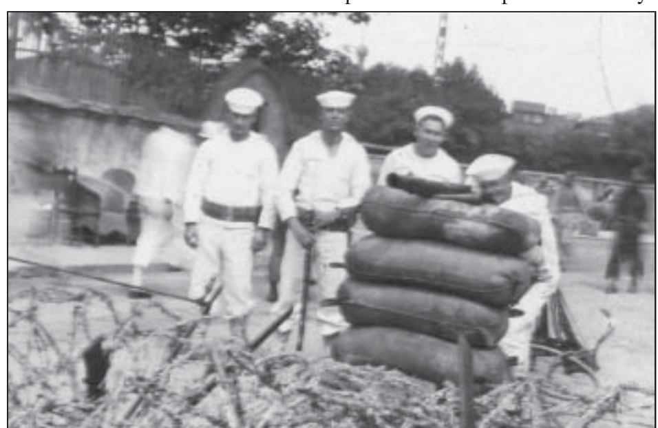
Having no troops to deploy, members of the ship's company of the various destroyers and gunboats in Chinese waters were employed on the ground. Here crewmen of the USS PAUL JONES (DD-230) set up a gun emplacement during the anti-foreign rioting of the early 1920s. The single Lewis machine gun and a few old rifles, probably model 1896 Krag-Jorgensen carbines, were usually enough to keep trouble at bay.

That policy, in which the Chinese had little or no say, was the result of international treaties that turned most of the country's coastal towns and cities into free-trade ports. Much of the 1920s' widespread unrest and violence against foreign lives and property was triggered by student demonstrations after World War I when secret Allied treaties gave parts of China to Japan and Germany.